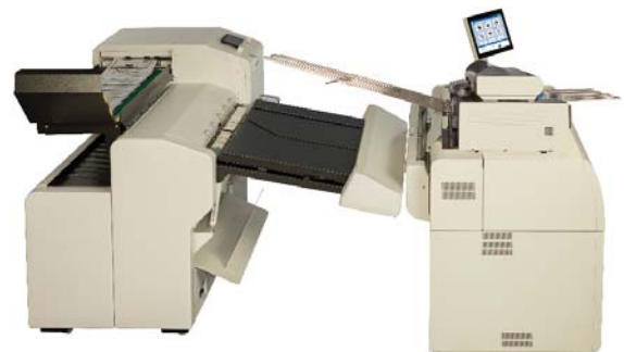
KIP 7990 production system with KIP 2300 scanner & optional KIPFold 2800 online fan & cross folder