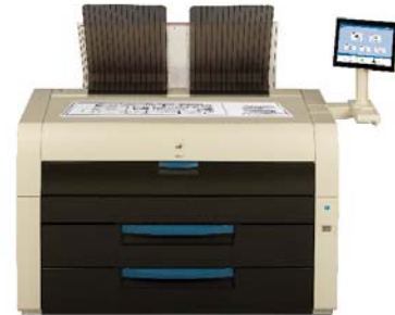
KIP 7970 network print system with integrated top stacking print tray

The KIP 7970 network print system with top stacking meets the tough workflow demands of digital print environments. The Perfect View adjustable KIP smart multi-touchscreen is ideal for selecting multiple files from a variety of network resources for print set submission and managing system features.