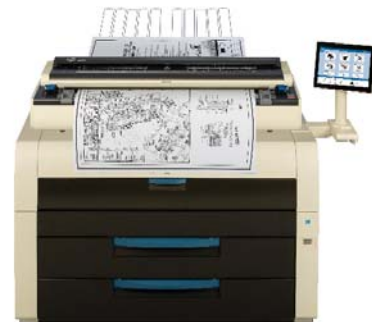
KIP 7990 MFP system with KIP 2300 CCD production scanner

The KIP 7990 Production MFP systems address the current reality of demanding print runs and compressed delivery times coupled with the highest quality expectations. Operators will enjoy superior pre-flight and print submission productivity using the professional applications within the KIP System K Print Management Suite. The KIP 2300 CCD production scanner sets a uniquely high standard for color scanning speed, face up/face down/thick media document feeding versatility and digital imaging quality.