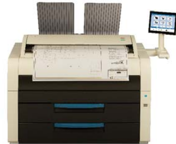
KIP 7980 multi-function system with integrated CIS scanner & top stacking print tray

KIP 7980 MFP systems feature an integrated CIS scanner and innovative top stacking to fit where you need it – in tight spaces or against the wall for easy access to all system features. Increase copy, scan and print workflow efficiency with the powerful KIP smart multi-touchscreen for intuitive feature selection and easy operation. Zoom, rotate and pan vivid on-screen previews for eight point Area of Interest editing and printing.